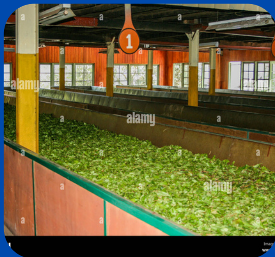
Cooperative tea factories