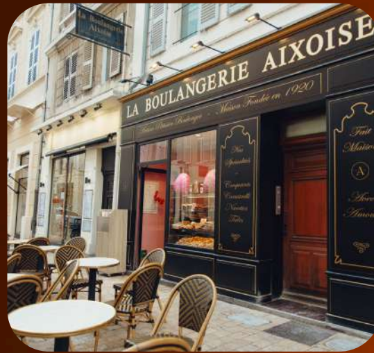
Bakery & Pastry Shops