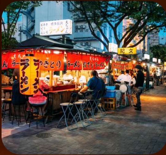
Fast Food Restaurants